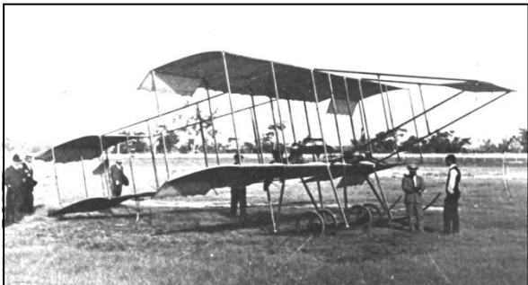
The first flight of a heavier-than-air machine in 1911.