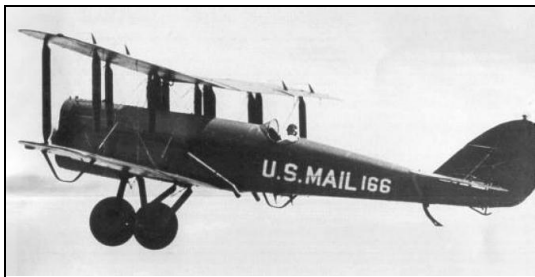
DH9, used on the world's first air mail service.

Brian Pope's interest in aviation and philately has resulted in a collection of stamps and covers* that trace the history of the air mail system (*a cover is a stamped addressed envelope that has been through the postal system). Brian told us how the first air mail got under way in the USA when a converted DH9 aircraft was used to carry mail across the country. He showed a photo of the aeroplane type and an envelope that was posted in the first year of that service in USA.