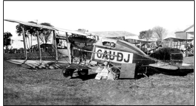
A WAA Bristol Tourer with mail ready for loading.

In 1929, WAA also won the contract to provide an east-west air service between Perth and Adelaide. It could now carry mail from Derby to Adelaide, making it the longest air service in the world.