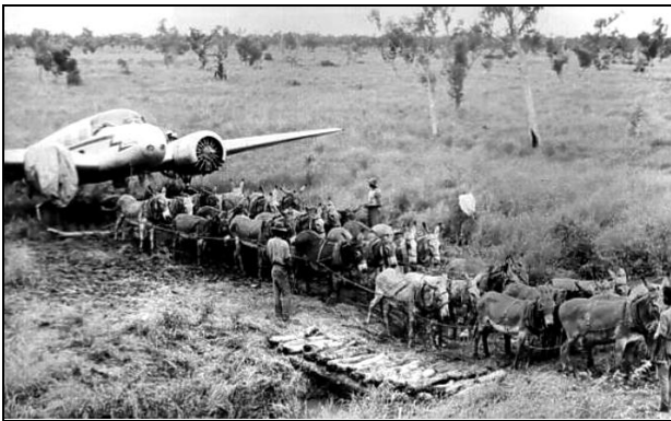
The salvage of the Lockheed Electra on Napier Downs.