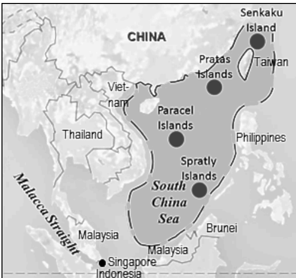
Map of the South China Sea.

A significant source of tensions in the region is the competing legal claims of territorial sovereignty over the approximately 230 islands. The South China Sea is bordered by not only China, but also by Vietnam, Malaysia, Singapore, Brunei, the Philippines and Taiwan. Every year over one trillion dollars worth of trade is shipped through the South China Sea and freedom of movement of shipping and air traffic is under threat.