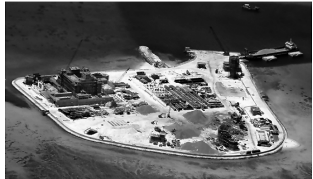
A development on a reef in the South China Sea.