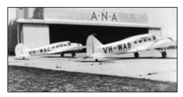
Two of Woods Airways Avro Ansons.

service ceased in 1962 when the Ansons were declared un-airworthy.