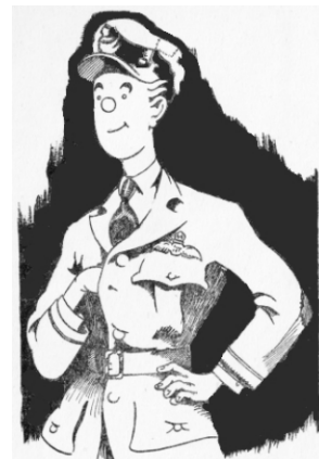
P.O. Percy Prune