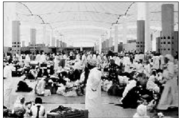
The Mecca terminal handles 80,000 people at one time.

Over 2,000,000 people arrive each year for the single event. It puts extreme pressure on all aspects of transport and communications.