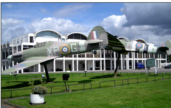
The entrance to the Hendon museum.