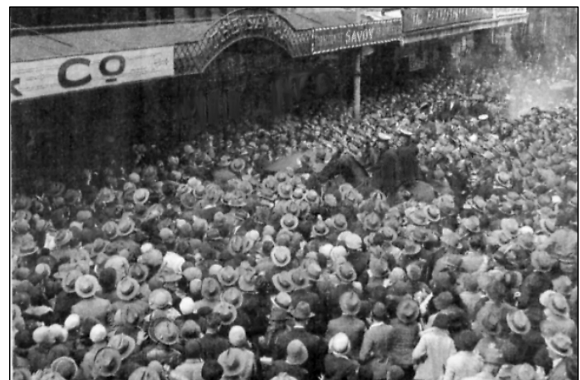
Her arrival at the Savoy Hotel in Hay Street.

After being granted life membership of this club she was driven to the city. The image above shows the dense crowd in central Hay St as she arrived at the Savoy Hotel; reports say there were over 4000 people to greet her.