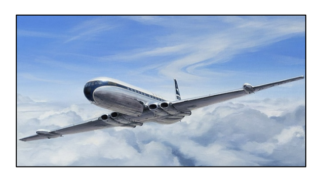
The Comet passenger jet.

Naturally, his talk covered the story of the ill-fated Comet passenger jet which suffered structural failures in its early years.