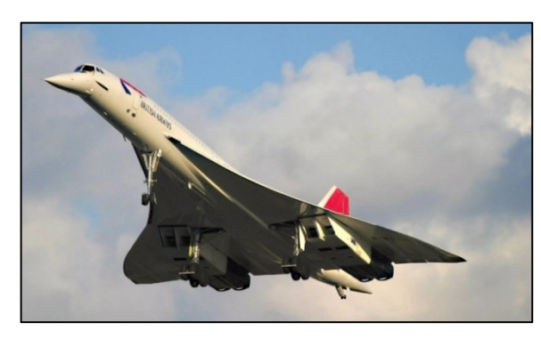
The Concorde on takeoff.

touch down and take off spots on the runway during tests.