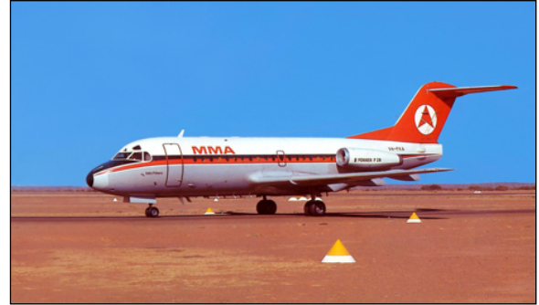
The Fokker F28 Fellowship in outback W.A.