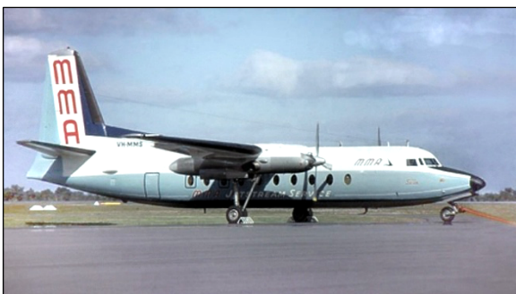
The Fokker F27 Friendship, VH-MMO, at Perth.