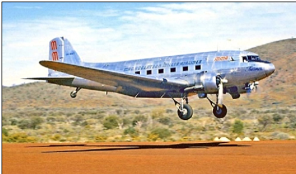
The Douglas DC-3 landing at Wittenoom.

He spoke of the difficult flying conditions, of adverse weather and fog at various airports, of jet streams and wind shear which affected navigation, magnetic compass irregularities, caused by the huge iron ore deposits in the Pilbara - and of a few unruly passengers who were encountered from time to time.