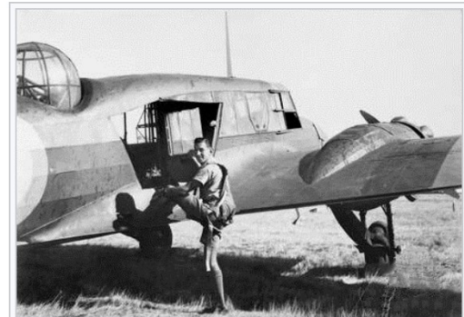
Student pilot of No. 4 Service Flying Training School boarding his Anson, March 1942